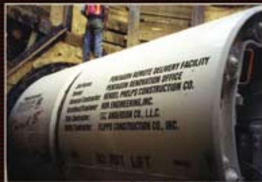
Top: Launch Lovat TBM under Pentagon.

"They get it done," says Eisold, simply describing one of Bradshaw Construction's basic philosophies.